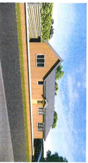
7 Front View 3D 1 : 1