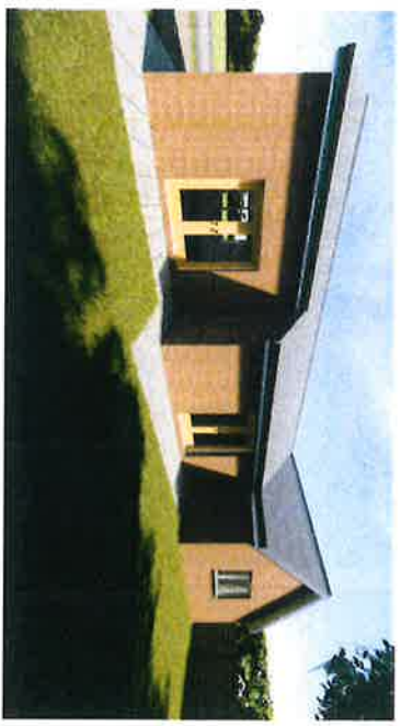
8 Rear View 3D 1 : 1