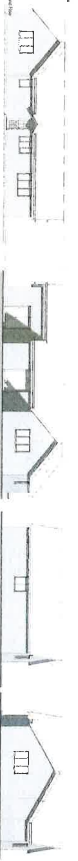
1 Front Elevation (West) 1 : 100